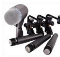
Shure Drum Mic Pack

AT Wireless Lapel Mic inc. transmitter and receiver