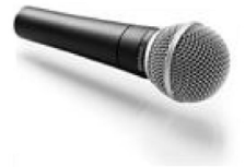
Shure SM58 Microphone

Inc. Beta 52, 3 x Sm57, clips to connect onto drums