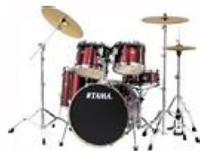
Tama Superstar Kit

ROLAND HD-1 Electronic Drumkit with Stool.