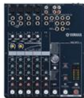
Yamaha Mixer 8-input

Allen & Heath 16 mono/3 stereo ins, 4 aux, 3-band mid-sweep EQ, LR, USB IO, FX.