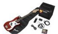
Fender Squier Precision

Inc. Squier Strat, GDec Jnr Amp, Strap and Cable