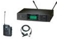
AT Wireless Lapel Mic

2 x 12" cones, 1000 watt powered speaker